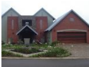
WORK OF ART: Six Fountains Estate R2 260 000 (see page 2)

storms. Like soldiers in an army, each player has to stay alert and prepared. That's what each one of us should have learnt from 2009.